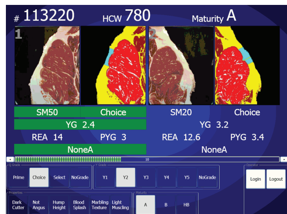
Figure 1. E + V Vision Grading System Display

All of the brands of beef produced by Cargill Meat Solutions have a tenderness claim. This tenderness claim is managed through pre-harvest quality control points and multiple post-harvest patented processes. The tenderness claim is verified through random testing using slice shear force after 14 days of aging. Cargill is currently working on the implementation of an on-line tenderness prediction technology and has found positive trends in their data.