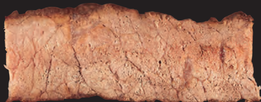
VERY WELL DONE Approximately 180°F, 82°C