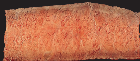
MEDIUM Approximately 160°F, 71°C