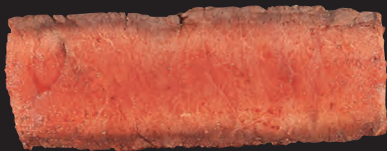
RARE Approximately 140°F, 60°C