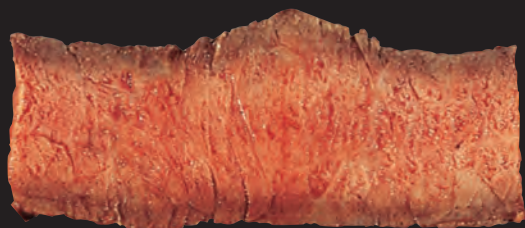
MEDIUM RARE Approximately 145°F, 63°C