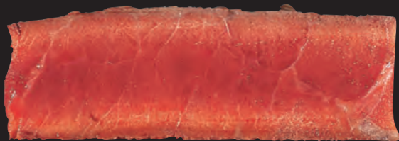
VERY RARE Approximately 130°F, 55°C